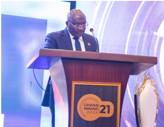
MAHAMUDU BAWUMIA VICE PRESIDENT OF THE REPUBLIC OF GHANA

The GHANA GOLD EXPO – MINING WEEK provides a multi-sectoral platform for the sharing and exchange of ideas, opinions and thoughts on the investment opportunities and challenges in Africa Gold sector, aimed at implementing strategies for accelerated growth in mining in addition to assuring resilience on all fronts and at all times as Africa's economic bedrock.